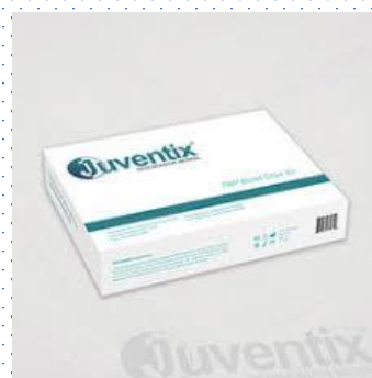
Additional Blood Draw Kits